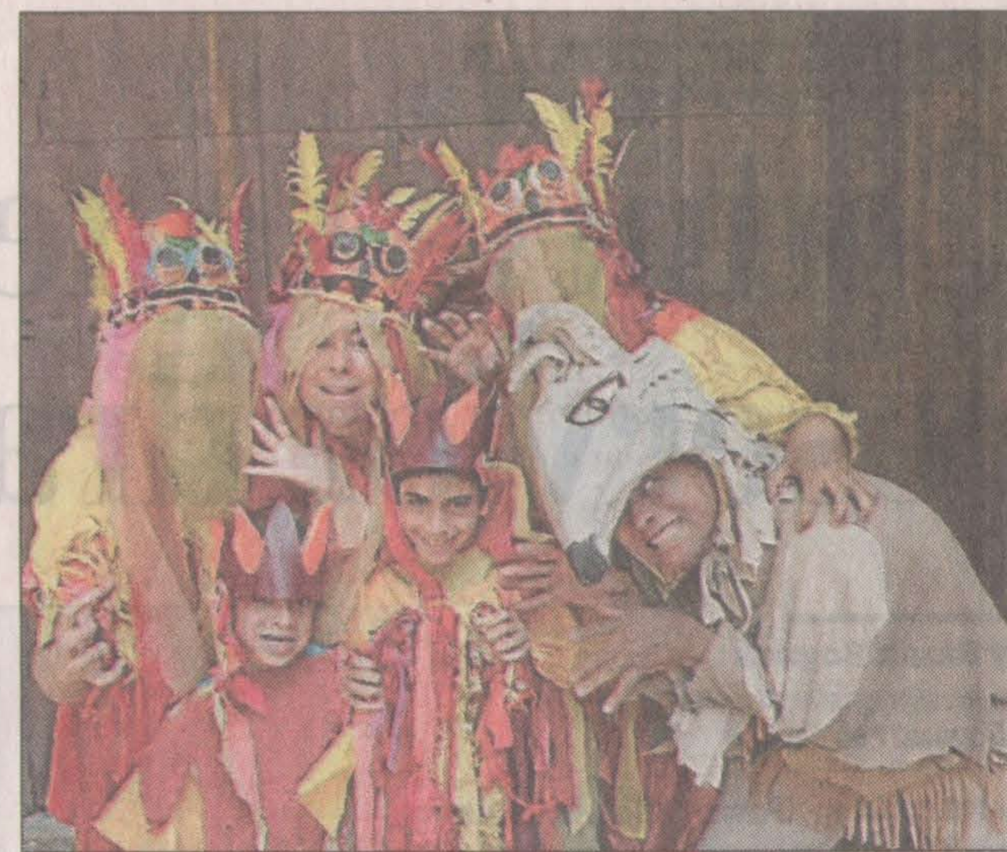
Parents and children pose in costumes from the Trickster Coyote performance.